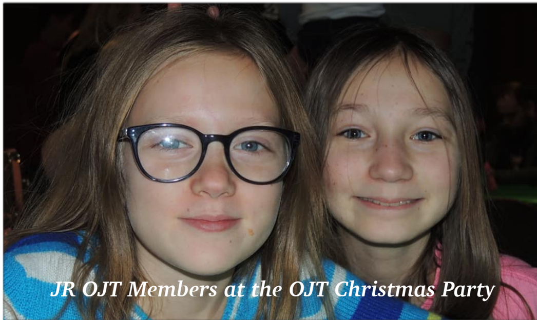
JR OJT Members at the OJT Christmas Party